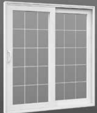
3 x 5 grids

Note: Also available with raise/lower LOW E blind.