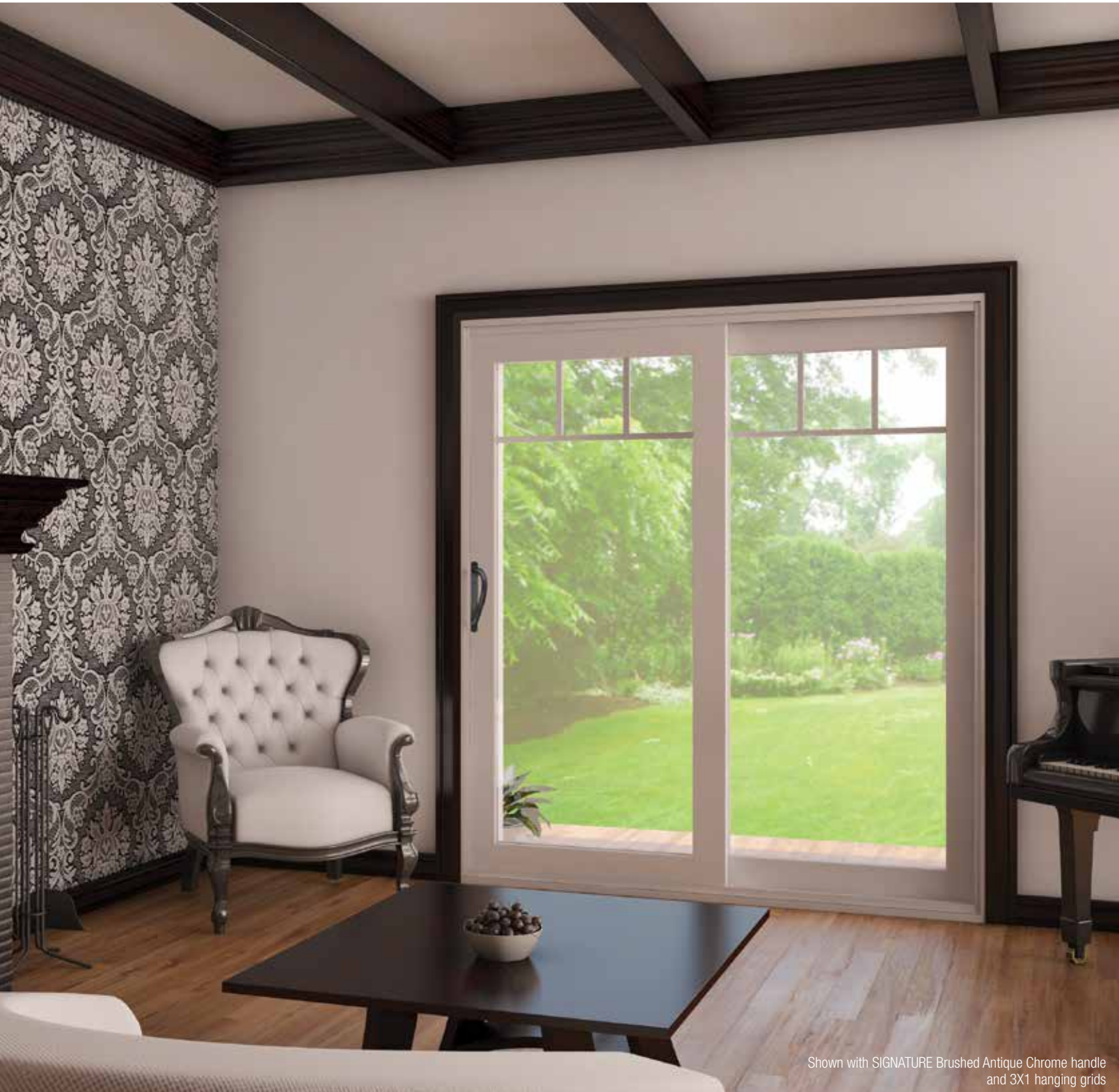
Shown with SIGNATURE Brushed Antique Chrome handle and 3X1 hanging grids