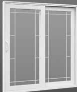
3 x 5 contour grids