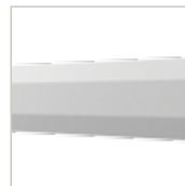
1 3/4" divider

WIDE VARIETY OF COLORS FOR YOUR PATIO DOOR AVAILABLE UPON REQUEST