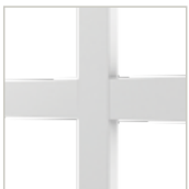
Rectangular 5/8" or 1"