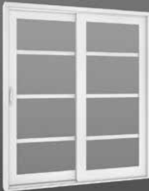
1 3/4" dividers Options: 1x3 / 1x4