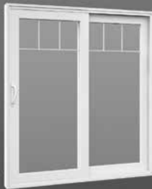
3 x 1 hanging grids