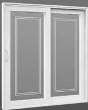
Elegance V-groove glass