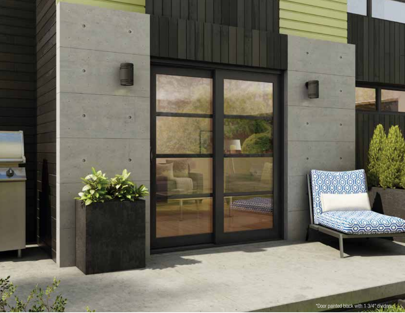
*Door painted black with 1 3/4" dividers.