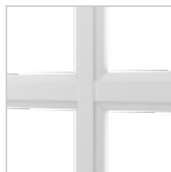
Georgian 5/8" or 1"