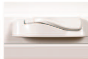
Folding & Nesting Handle