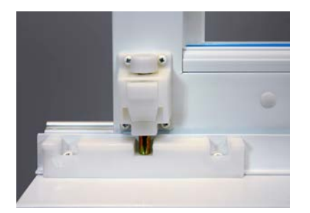
Three-position foot lock option (Option only available in white)

Double-point mortise lock (Option shown with Look handle)