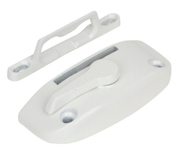
Self Engaging Lock