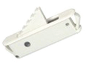
Vent Control Stop