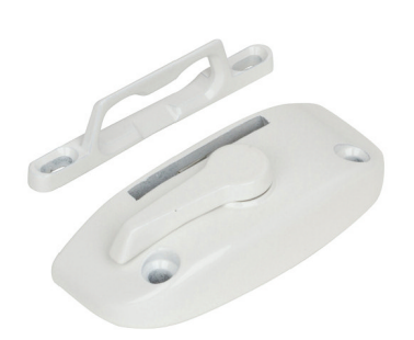
Self Engaging Lock